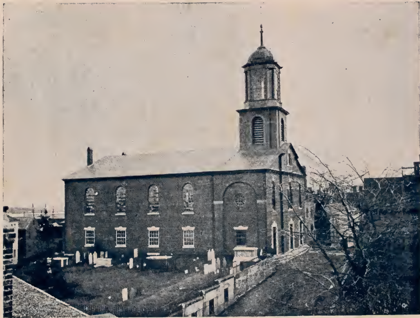
St. John's Episcopal Church, Chapel Street, on site of Queen's Chapel—built in 1732. Portsmouth, N. H.